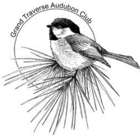
Official GTA club logo by Tom Ford